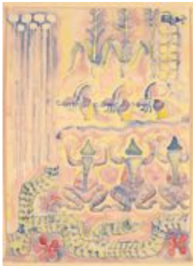
Walter Anderson, Frogs, Bugs, and Flowers 1945, Watercolor on paper

Mississippi artist Walter Anderson used these seven motifs to create his paintings and ceramics. Anderson is known for his use of repetition to create his watercolors depicting nature.