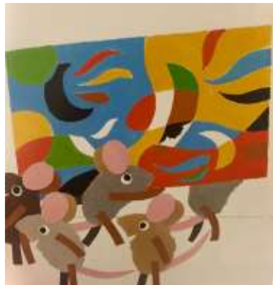
Abstract: a picture from the artist's imagination made up mostly of colors and shapes