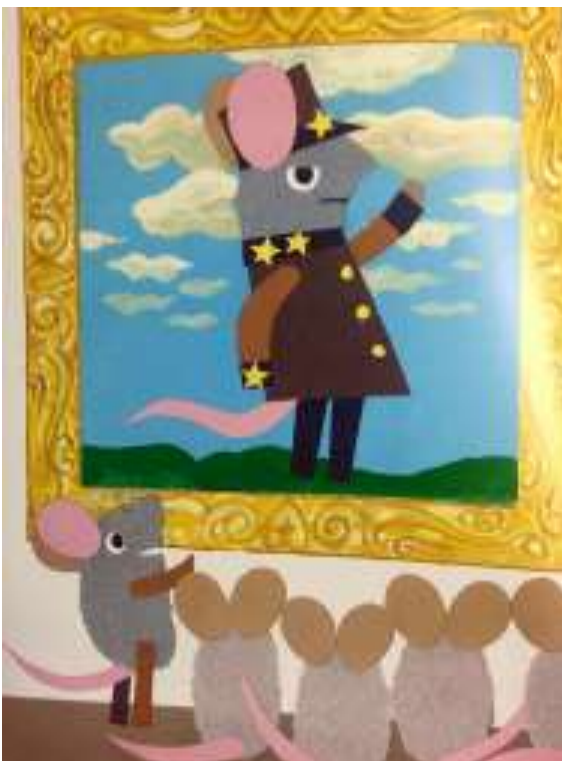
Portrait: a picture of a person