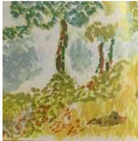
Landscape: a picture of the outside or nature