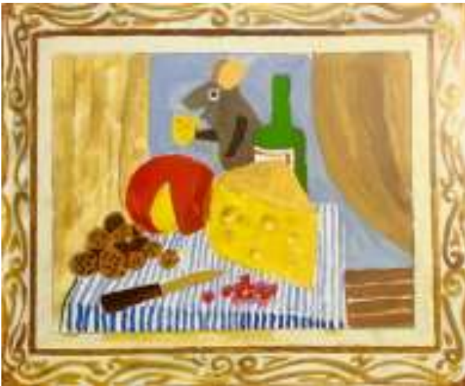
Still Life: a picture of objects that cannot move