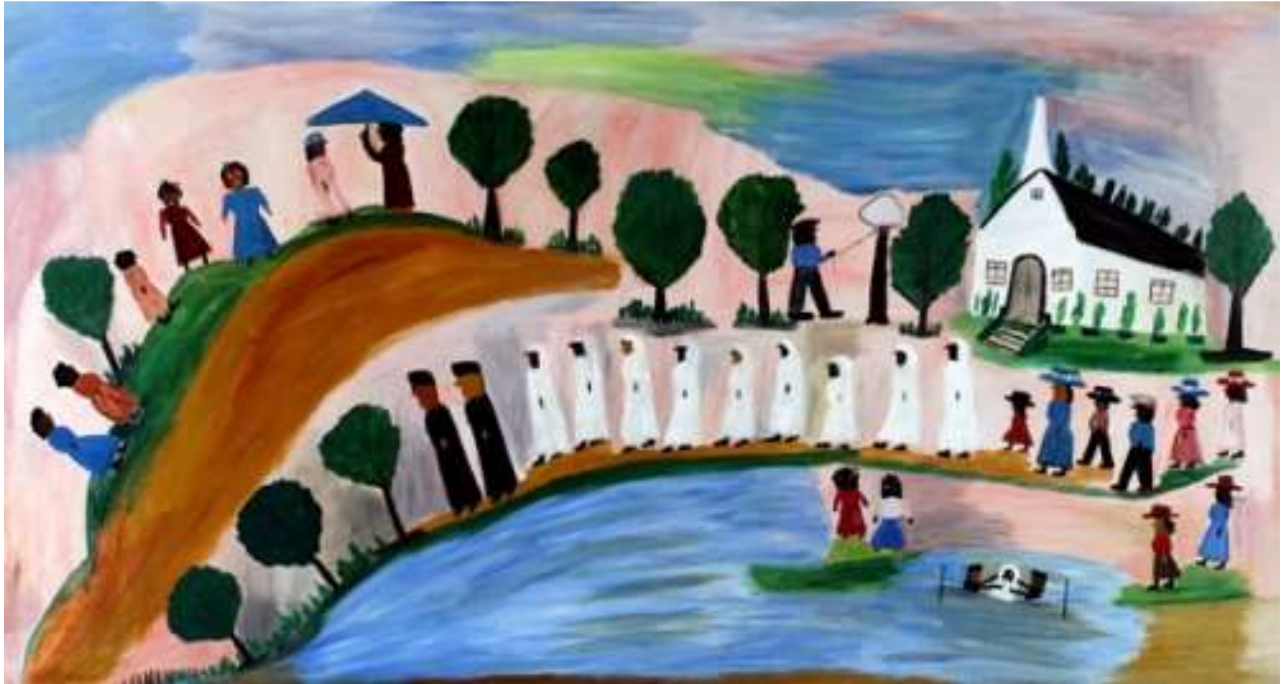
Clementine Hunter, Panorama of Baptism on Cane River , 1945