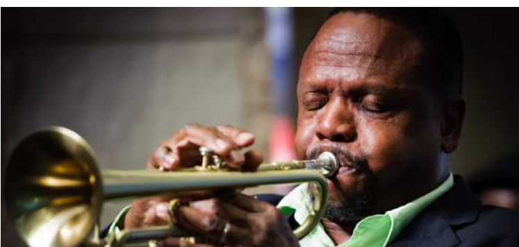
Ogden After Hours- Thursdays from 6pm-8pm

MEMBERSHIP DISCOUNTS Seniors, active duty military, veterans, educators, students, and staff from other museums receive 10% off any membership level. Verification of status required either at museum or via email for online purchases.