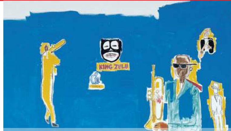
King Zulu , 1986, Acrylic, wax, and felt-tip pen on canvas; 79 3/4 x 100 3/8 in. Museu d'Art Contemporani de Barcelona (MACBA), Government of Catalonia Art Fund, Former Salvador Riera Collection, Spain, © Estate of Jean-Michel Basquiat, ARS, ADAGP Basquiat and the Bayou , Presented by the Helis Foundation October 25, 2014 - January 25, 2015