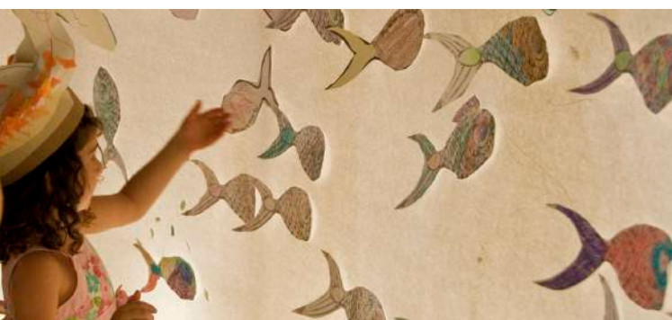
Ogden Museum Education